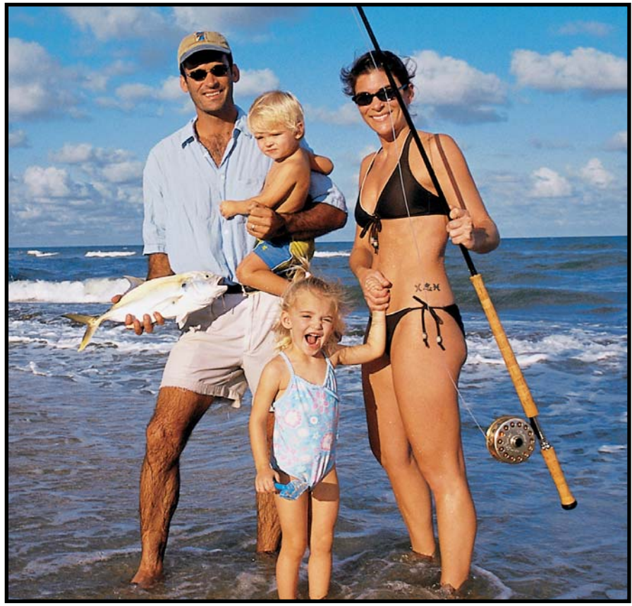
Dad fishes while mom and kids play at Phipps Reef, in Palm Beach. A beach fill project here purports to restore recreation, but families come because of the reefs.

Indeed, tourism and property taxes account for massive economic injections. Flack said the numbers exceed $50 billion to date, without offering a specific time frame. And while Strong's research is reviewed, it seems paradoxically comprehensive and generic. While the survey counts all beachgoers, the research