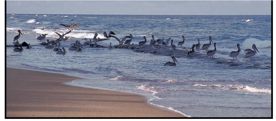
Pelicans ambush mullet on reefs at Phipps Park. Turtle experts confirm there's no reason to expand the beach, and the reefs provide essential food and cover for juveniles.