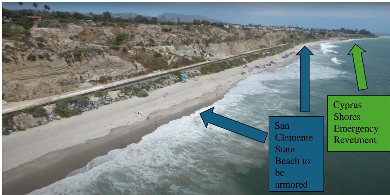
Image: This image depicts San Clemente State Beach where OCTA proposes to extend the engineered revetment by 2/3 mile, covering the entire State Beach and parts of Calafia State beach, adjacent to the north (not pictured). In the far distance, you can see the existing emergency revetment fronting Cyprus Shores HOA and Cotton's Point.

Image: San Clemente State Beach heavily utilized and featuring robust coastal dunes. This image depicts the 2/3 mile shoreline armoring where OCTA proposes to extend the engineered revetment – destroying access and coastal dunes.