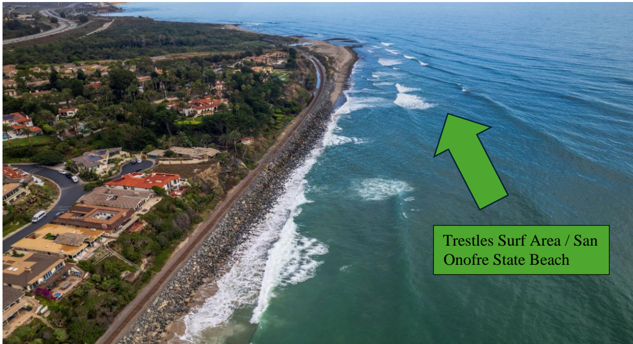
Image: OCTA's emergency armoring fronting Cyprus Shores HOA in August 2023 (placed in 2021/2022). The proximity to Trestles Surf Area is clearly visible.