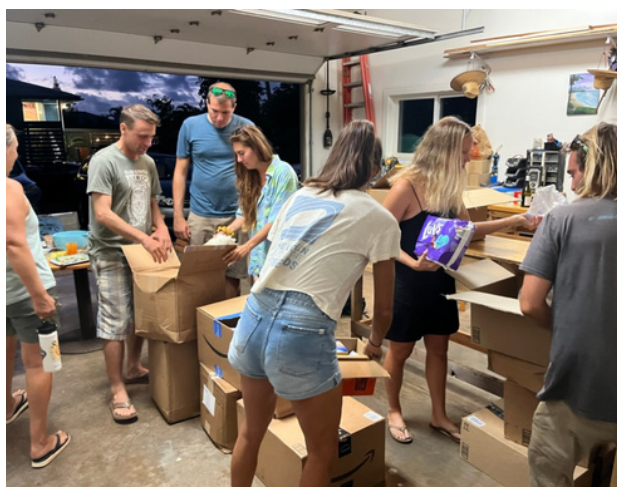
Maui Chapter volunteers unpack donations for West Maui fire survivors