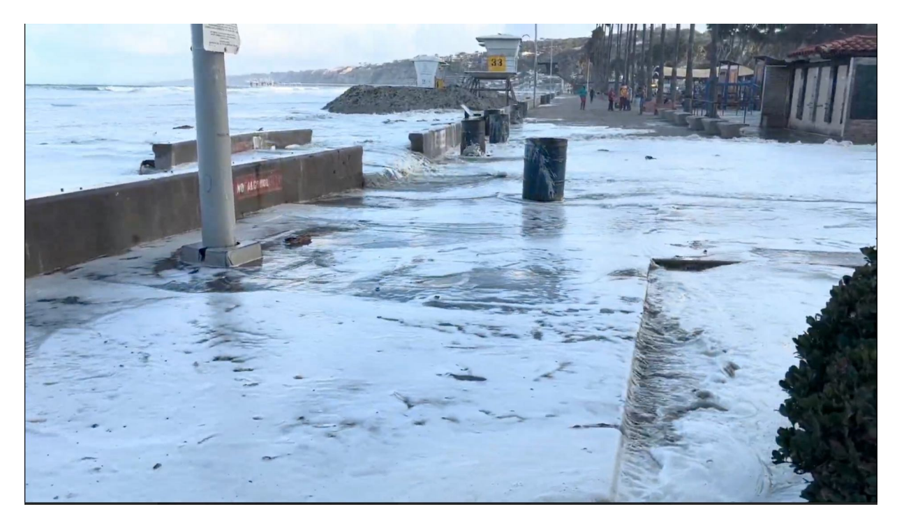
Flooded La Jolla Shores during the November '24 King Tides