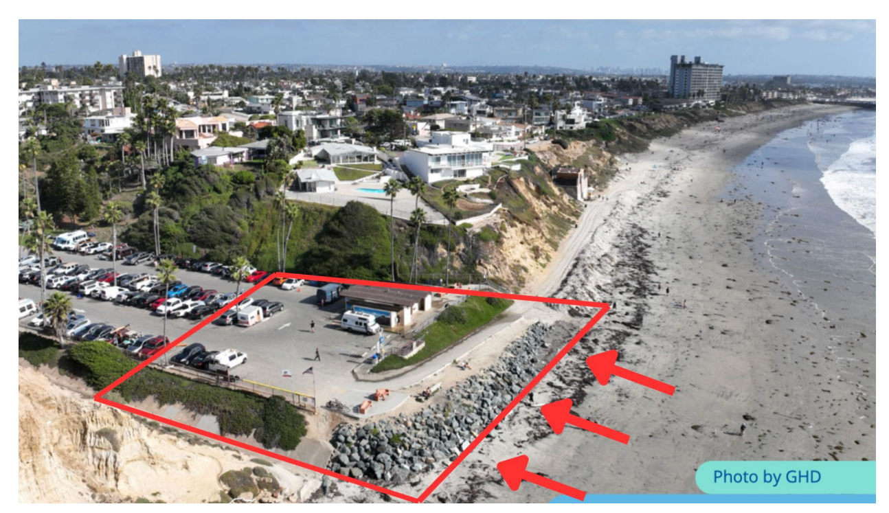
Giving the beach more space is the only way to create a Resilient Surf Park