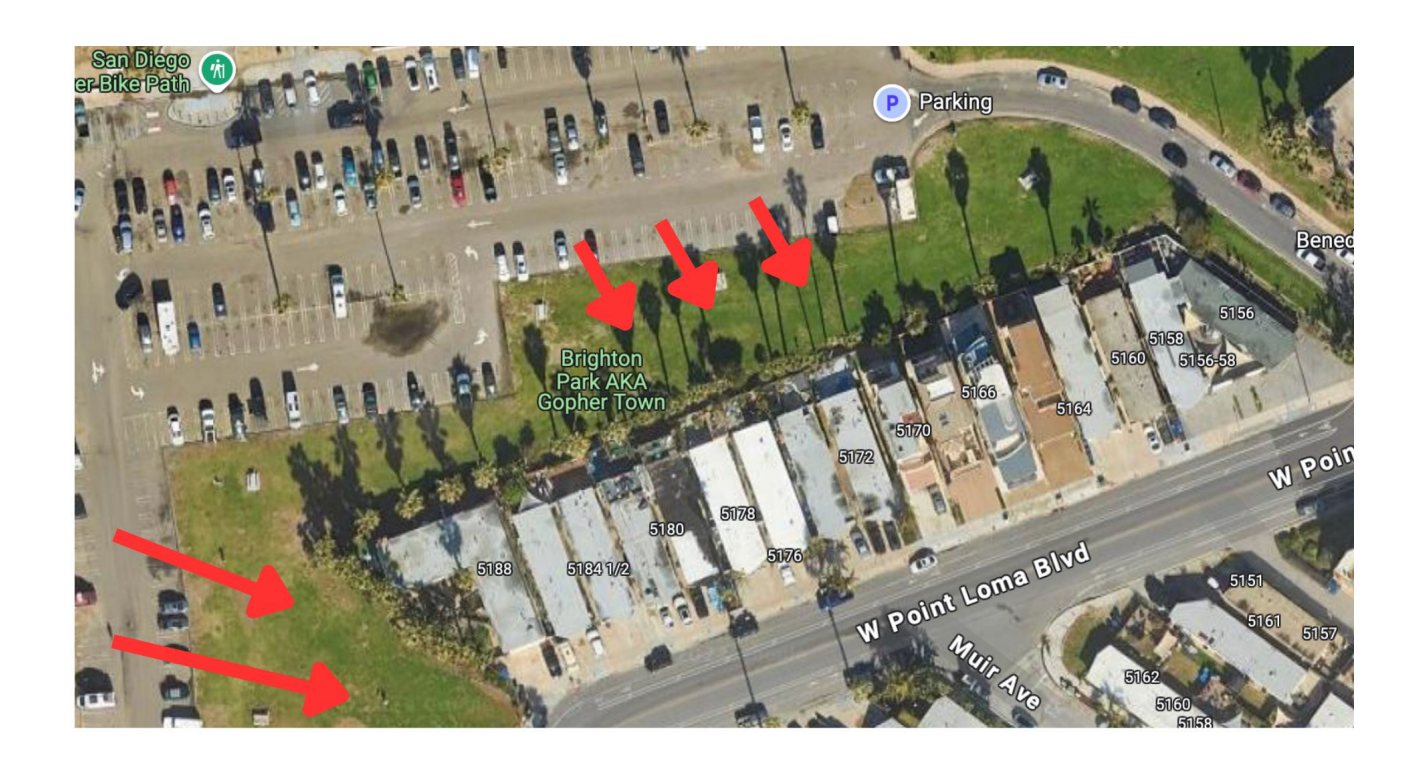
Brighton Park is underutilized due to its bad location. Such space would be more beneficial if beach-adjacent.