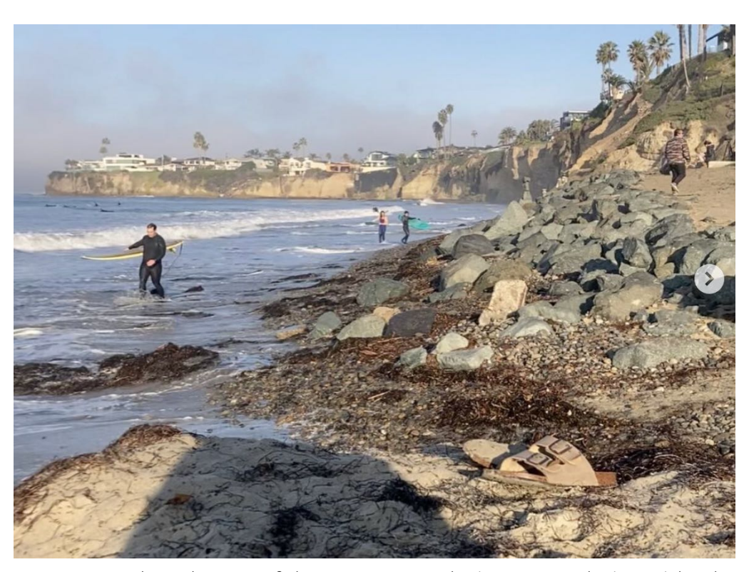
The ocean reaches the toe of the revetment during annual King Tides (2022)